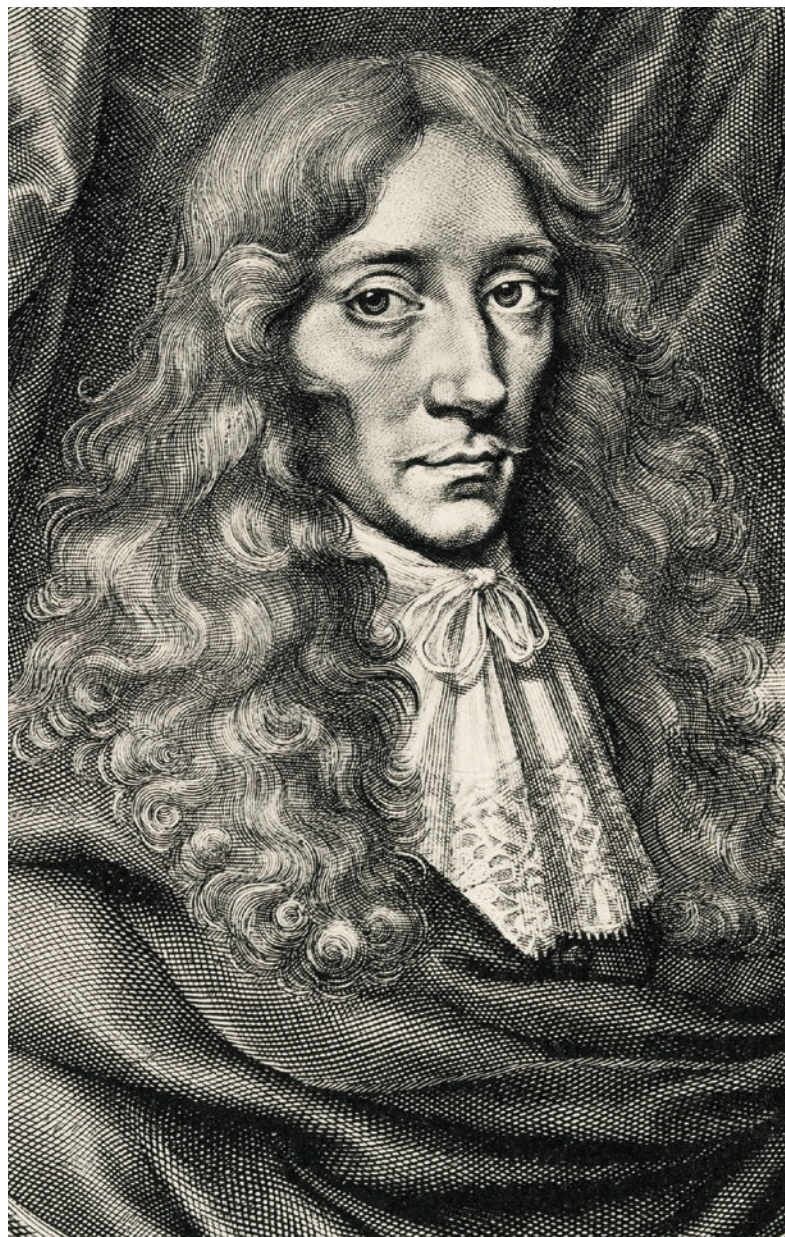
Robert Boyle is often considered the father of modern chemistry