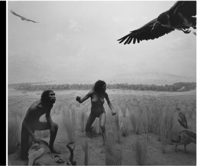
E. Homo erectus