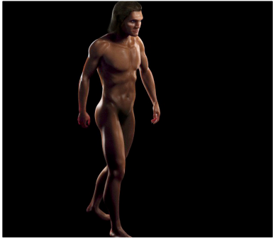
A. Homo sapiens

Directions: Take a look at this set of images showing some of our early ancestors. Using your intuition and anything you've learned before, arrange the images in order, from our earliest ancestors to our own species, Homo sapiens . Don't worry about being completely accurate, just have some fun and make your best guess. This activity provides an opportunity to start thinking about human evolution and should be quick. After you have arranged the images, jot down everything you can think of that differentiates humans from our ancestors. Later in the lesson, you will have a chance to form a deeper understanding of how humans have evolved from our early ancestors..