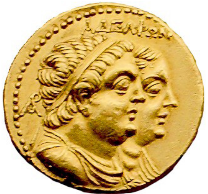
Gold coin featuring the busts of Ptolemy II and his sister/co-ruler, Arsinoe II.