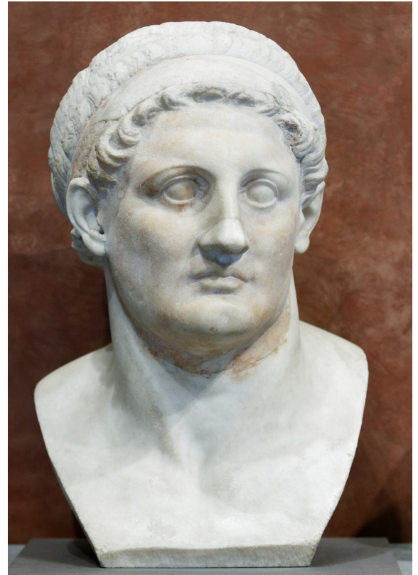
Bust of Ptolemy I Soter in the Louvre Museum. By Jastrow, public domain.

The Ptolemies faced danger from other empires, particularly the Seleucid Empire to the east. The two empires battled repeatedly over their borders. These wars were expensive, which led to higher taxes. They also forced the Ptolemies to draft Egyptians into their army. Repeated wars and higher taxes caused unrest among the Egyptian population. That unrest sometimes erupted into revolts against Greek rule.