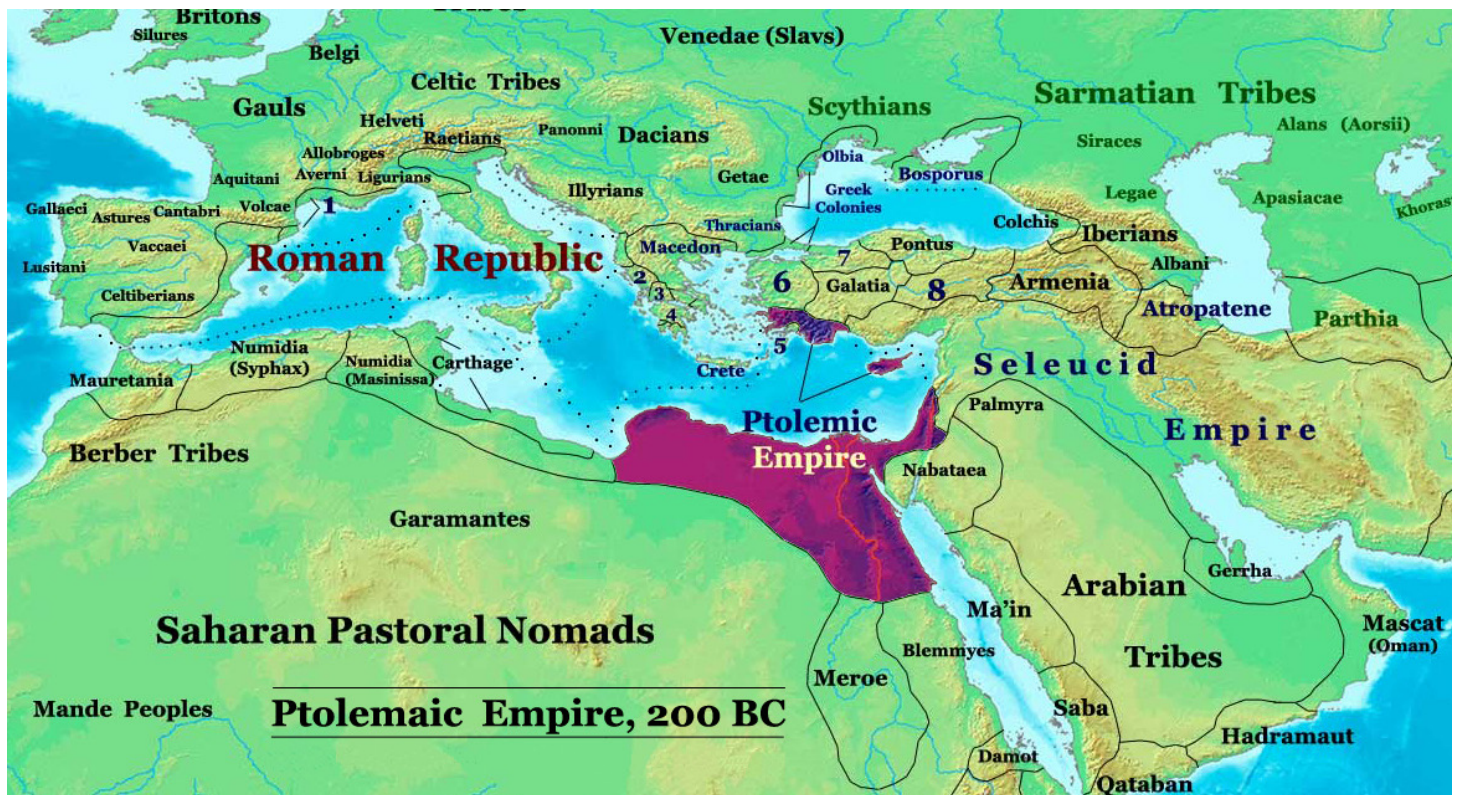
Map of lands claimed by the Ptolemaic Empire. Much of the Ptolemies' power came from their navy, with which they could defend their far-flung territories.

After Alexander's death, much of his empire quickly fell apart. In Egypt, however, Ptolemy continued to rule. In 305 BCE, he declared himself Pharaoh Ptolemy I Soter and established the Ptolemaic dynasty. Under the Ptolemies, 1 Egypt became the center of an empire that stretched from Libya to the Arabian peninsula.