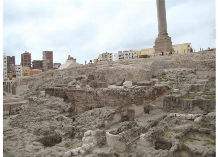
The ruins of the Serapeum of Alexandria, a temple built to honor the god Serapis. By Institute for the Study of the Ancient World, CC BY 2.0.

Because Alexandria was a key port, all kinds of goods were funneled through Egypt. These goods came from Arabia, China, India, and Africa. From Egypt, they were distributed across the Mediterranean. Frankincense and myrrh 2 arrived in Egypt aboard caravans from Arabia. Silk came from China and cotton from India. Indian Ocean spices came from the east aboard ships sailing the Red Sea. Ivory and gold traveled down the Nile River from inland parts of Africa.