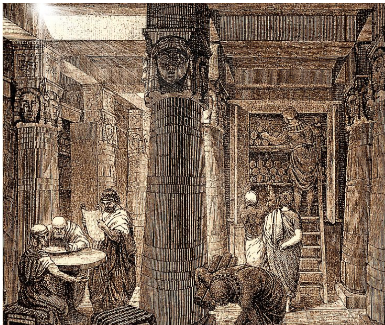
The Library of Alexandria, built by the Ptolemies, was a center of learning, employing dozens of scholars and holding up to 500,000 scrolls. Public domain.