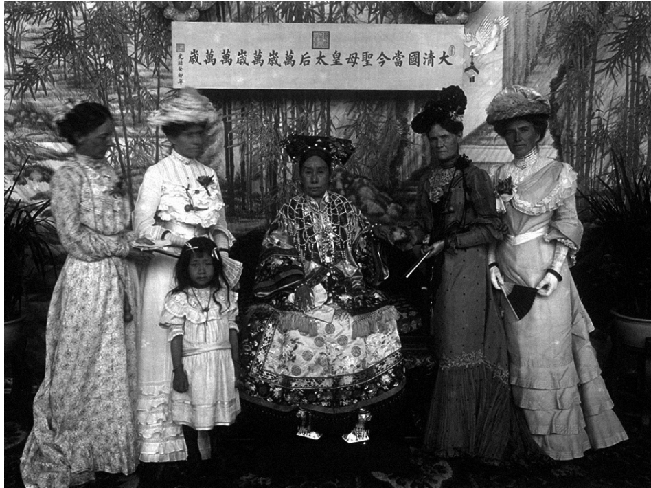
The Empress Dowager Cixi pictured with the wives of foreign (American) diplomats, 1903.

However, some Chinese wanted to modernize without becoming overly westernized. The proposed reforms angered traditionalists, including the Dowager Empress. Cixi had been in a semi-retirement from 1889. Still, she exercised control over the court and the Guangxu Emperor, Cixi's nephew and successor to the emperor Tongzhi. In 1898 as the reform movement launched, Cixi came out of retirement to launch a coup (revolt) against the emperor. While successful in re-establishing her control, the coup simply encouraged other groups to find a way to force out the Qing family for good.