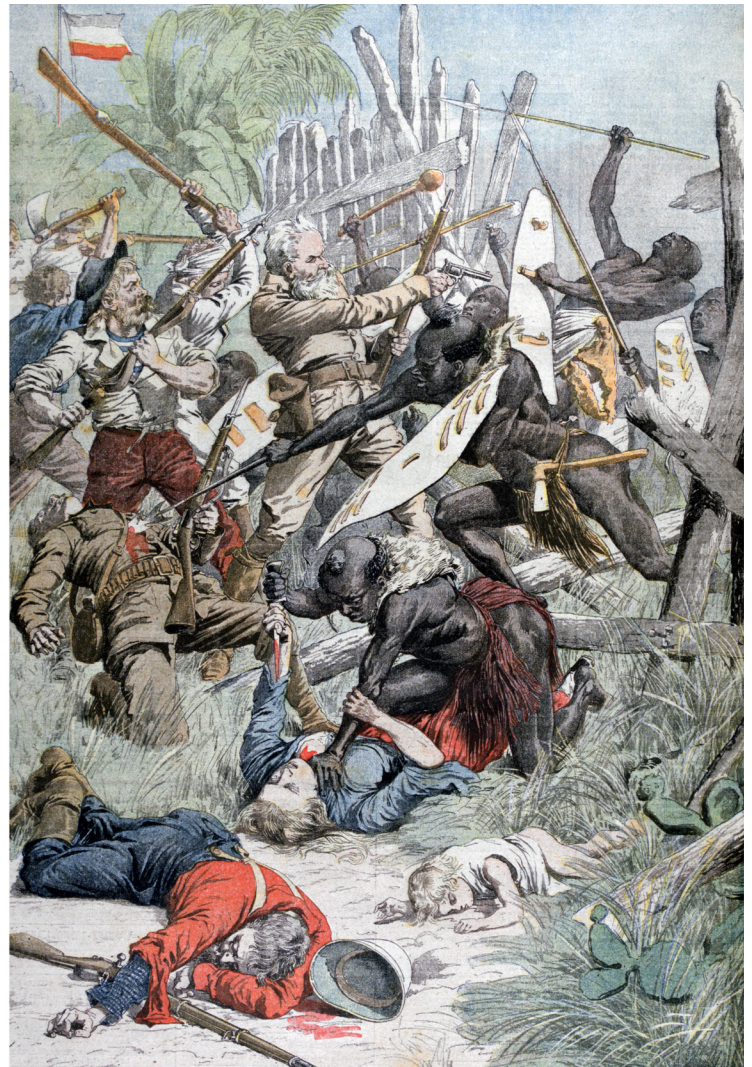
A German depiction of events in the Tanzanian uprising sometimes known as the Maji Maji Revolt.

Battles like this subsided for much of the next half-century. Subtler types of resistance endured. But military resistance reemerged after the Second World War. Then, changing global politics and new weapons and tactics made it possible for Africans to eject Europeans from the continent.