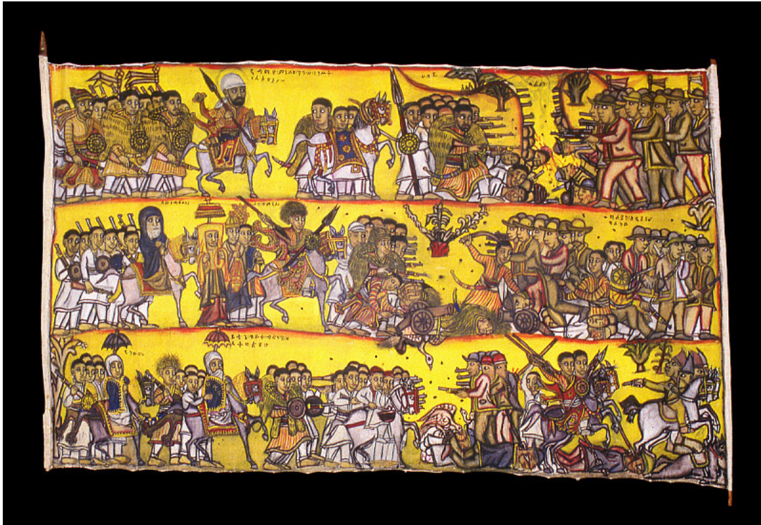
An Ethiopian tapestry depicting the Battle of Adwa. National Museum of Natural History, public domain.