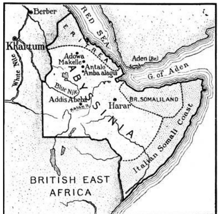
An 1899 map of Northeast Africa shows Italian and British territory along the coast, as well as independent Ethiopia, which is labelled "Abyssinia". Public domain.

Menelik and Taytu brought together an ethnically and religiously diverse army of 100,000 men. Meanwhile, Ethiopian peasants harassed the approaching Italian army. On March 1, 1896, the two armies met at Adwa. The Italians were divided into three groups, each of which was surrounded and attacked by Ethiopian forces. By 9:30 in the morning, the Italian force had been defeated.