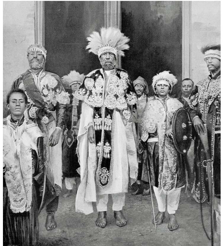
Menelik II, Emperor of Ethiopia.

In the end, Menelik's letter was largely ignored. Although Ethiopia escaped “protection,” the Europeans went about chopping up the rest of the continent among themselves.