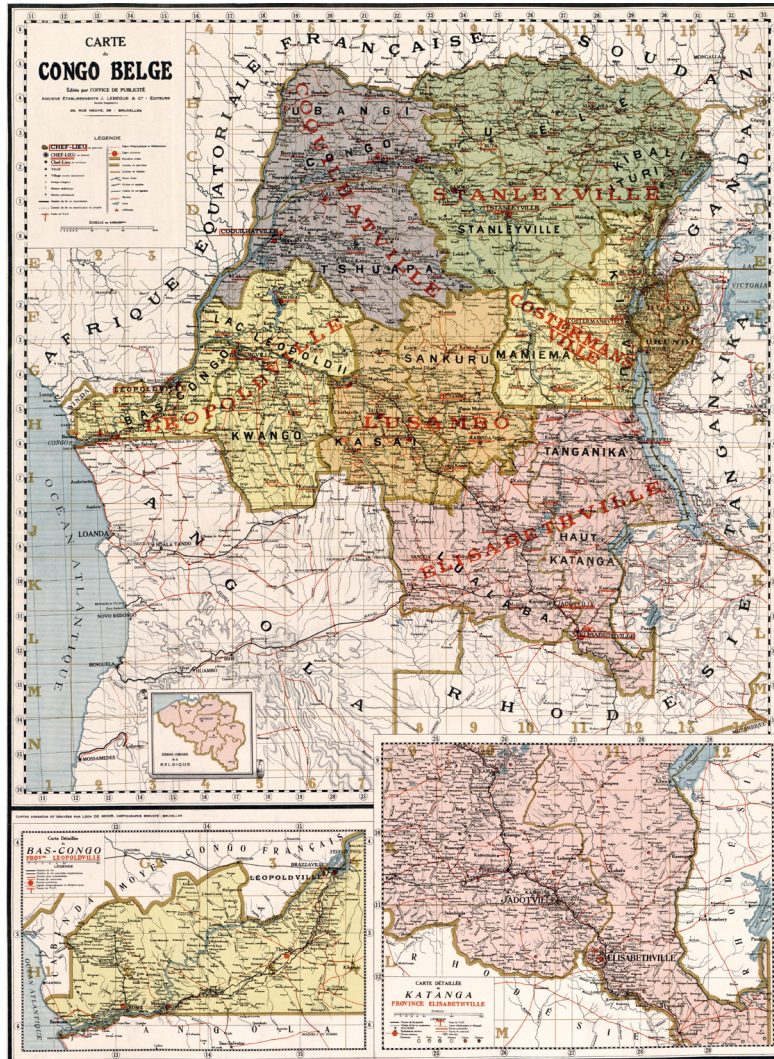
Map of the “Belgian Congo,” which began as the “Congo Free State,” King Leopold II’s personal territory. Note Portuguese Angola to the south and French Equatorial Africa to the north.

Although Leopold deceived most Europeans for a while, his fellow rulers caught on to his trick. The French immediately sent out expeditions to claim the territory to the north and the British convinced Portugal to expand their claims to the territory to the south in order to block Leopold.