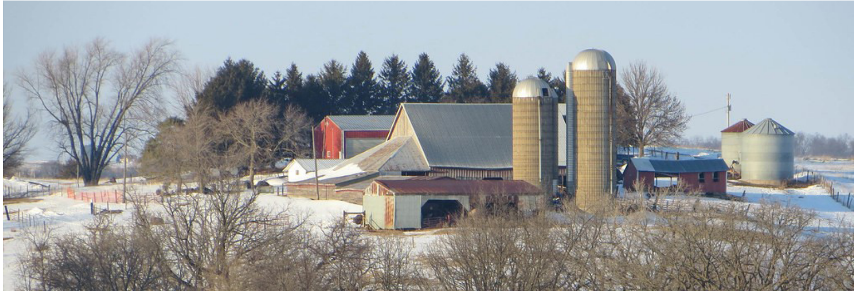
Near Wyoming, Iowa, by davidwilson1949, CC BY 2.0.

“Today, most of Iowa’s land, about 85 percent, is farmland. The state includes 35.7 million acres of land and over 30 million acres are farmed in Iowa. Most of this, about 26 million acres, is cropland and the other 1.2 million acres is used as pastureland. There are about 88,000 farms in Iowa and the average farm size is 345 acres.