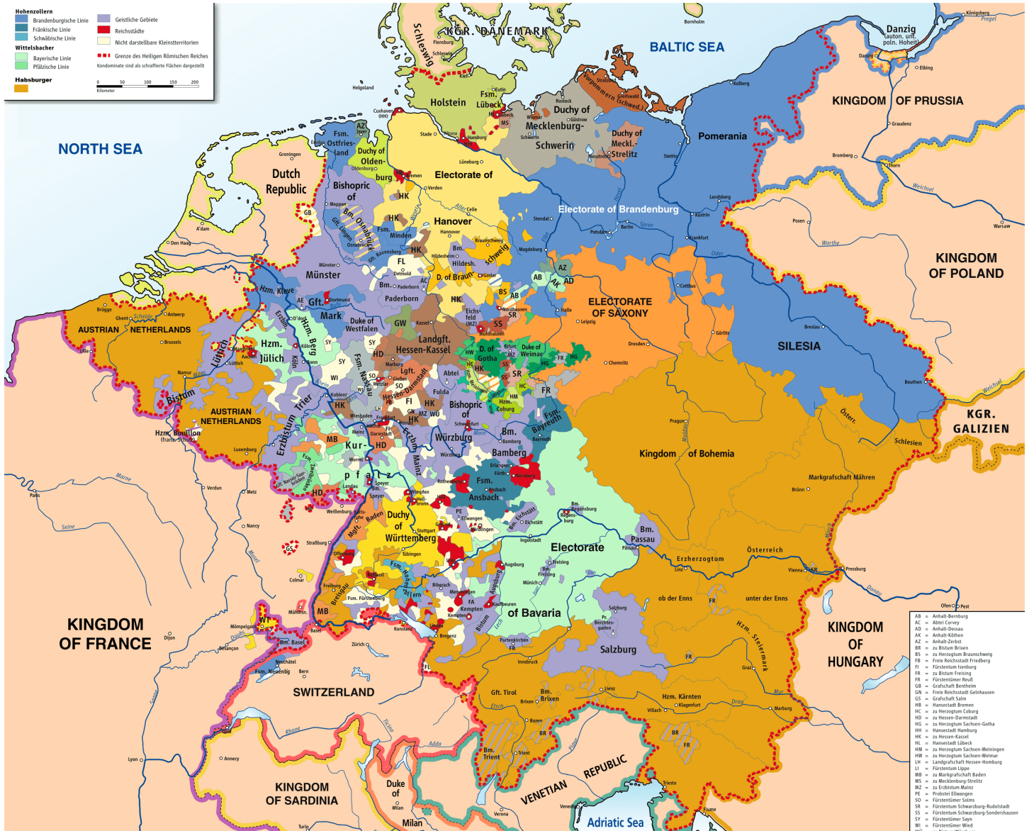
Map of the Holy Roman Empire in 1789.

For almost a thousand years, present-day Germany sat at the heart of a multi-ethnic political mess known as the Holy Roman Empire (HRE). For most of its history, the HRE wasn't much of an empire. It was a collection of hundreds of smaller states. They were ruled loosely by an emperor who was elected by a council of aristocrats.