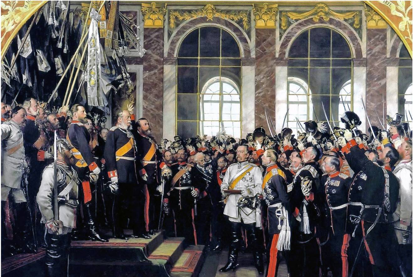
Proclamation of the German Empire in the Hall of Mirrors, Versailles, France. Wilhelm I stand on the dais, and Bismarck wears white in the center of the painting. By Anton von Werner, public domain.