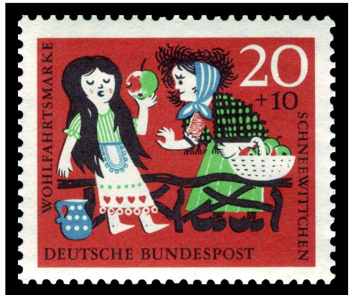
German postal stamp showing Snow White eating a poisoned apple, 1967. The stories told by the Brothers Grimm are still a part of German national identity.

Growing German nationalism also expressed itself in the two world wars that would come later. Built into the idea of nationalism is the exclusion of people defined as “other.” In order to have a German nation, nationalists believed they had to define what was not German. In the coming years, racism spread and minorities like Jews and Roma were targeted. Nationalists portrayed these minorities as a danger to the nation.