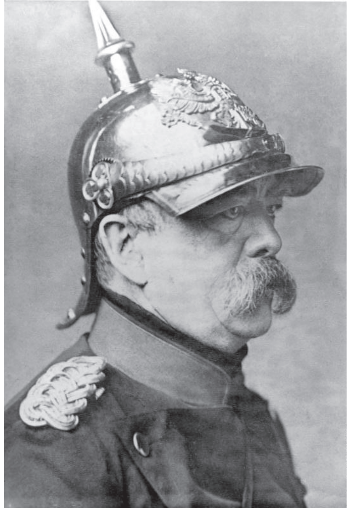
The always cheerful Otto von Bismarck.

However, Napoleon III had underestimated Bismarck's political talent. Bismarck tricked France into starting a war so he could claim that Prussia was merely defending the German states. The move turned the great powers of Europe against France. It also united the German states behind Prussia.